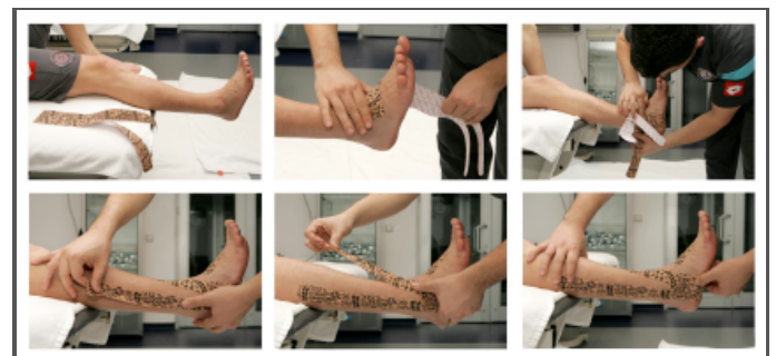
Figure 5. Application of dynamic taping