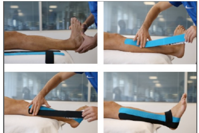
Figure 4. Application of Kinesiologic-taping

on. Taping was started to be applied from dorsum of the foot to the sole of the foot without stretching. Then the stretching was set maximum for the part between the sole and lateral malleolus. The ends of the Y-shaped tape were applied on two different points such as peroneal muscles and medial of the tibia (Figure 5) (5).