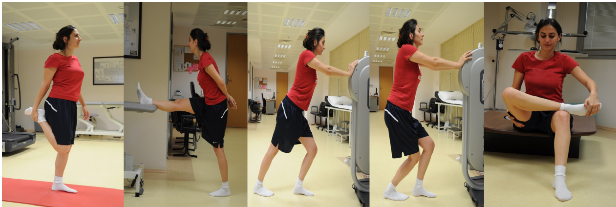
Figure 1. Static stretchings