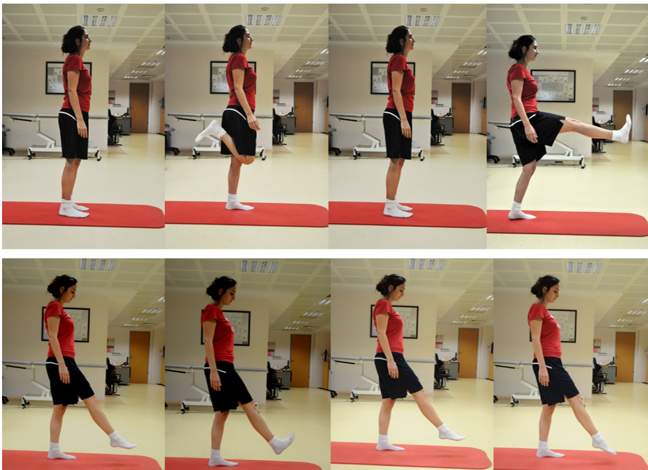
Figure 2. Dynamic stretchings

Quadriceps and hamstring stretching exercises were performed at standing position as described by Şekir et al. (15).