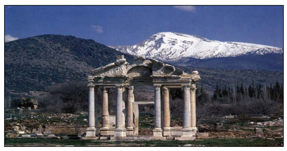
Fig. 1: View from the city of Aphrodisias.